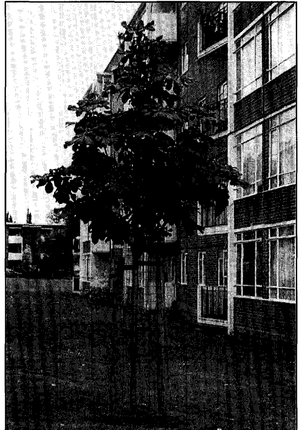
Figure 1. Tree supported with 2 stakes and protected with a wire mesh cage.

to either rule out or encourage the possibilities for tree planting. A decision was made to apply the same available funds as previous years to purchasing 16% of the quantity of the previous year but of larger, higher quality trees. Two hundred containerized advanced nursery stock (ANS) 16- to 18-cm girth (4-in. caliper) trees were selected specific to the identified site but based on nursery stock availability lists and historical success rates. To this end, species included Crataegus monogyna , Sorbus aria , and S. × intermedia , Platanus acerifolia , Fraxinus oxycarpa 'Raywood' and F. excelsior 'Jaspidea', Acer pseudoplatanus 'Leopoldii', and Aesculus hippocastanum 'Baumanii'. It was also decided to protect each tree with a weld-mesh galvanized guard supported by 2 diametrically opposed pressure-treated round wood stakes (Figure 1). To avoid accumulation of litter in the guard, a gap of about 200 mm (8 in.) was left between the bottom of the guard and ground level. Each tree was supported by rubber-sleeved strapping at