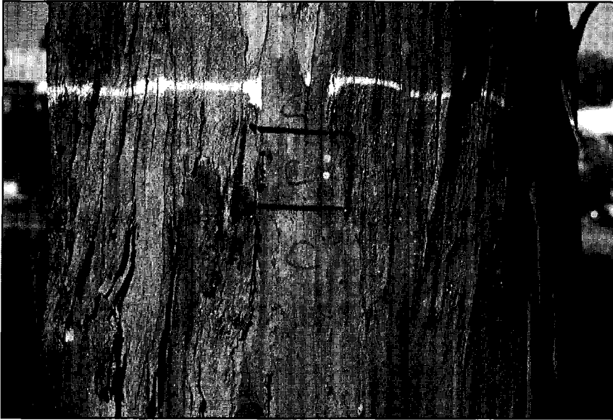
Figure 3. A template was used on all trees to consistently mark the location of Resistograph and drill measurements. Wood between measurement sites was sectioned and used for density analyses.

but 7.6 cm (3 in.) apart from these measurements, R2, D3, and D4 measurements were made in a parallel column. Three measurement sites were selected between 0.6 and 1.8 m (2 and 6 ft) aboveground on the trunk of each tree, for a total of 48 measurement sites on blue gum and 14 on elm. On 1 elm, only 2 template sites were accessible.