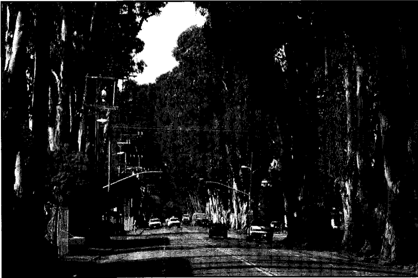
Figure 1. Sixteen Tasmanian blue gum ( Eucalyptus globulus Labill.) and 5 Scotch elm ( Ulmus glabra Huds.) were evaluated for decay in Burlingame, California. Trees were removed and sectioned following decay assessments.