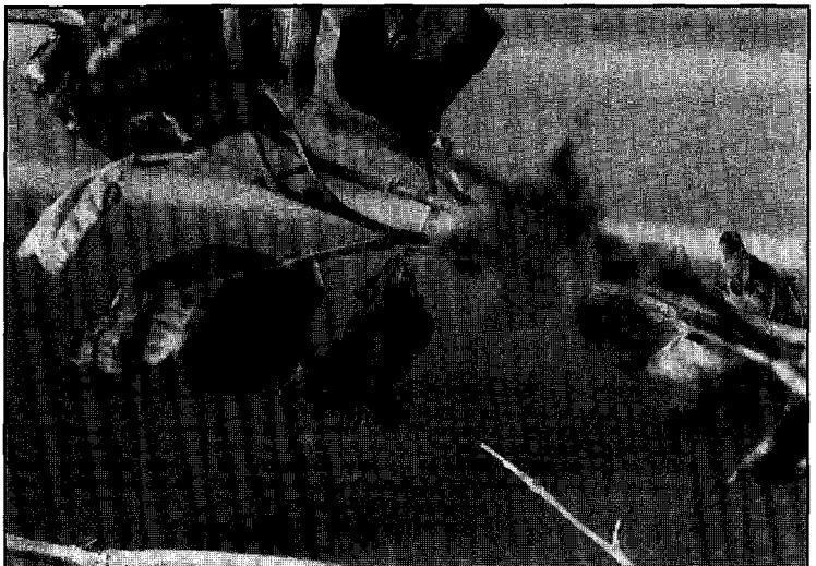
Figure 1. Saltwater spray desiccation of leaf margin and tip on London planetree growing along Atlantic Avenue.

A general crown thinning may occur as salt buildup in the soil causes soil structure destruction and root damage. In addition, trees may be deformed or misshapen due to greater damage on the