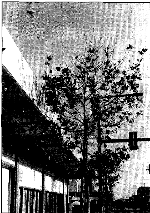
Figure 2. Saltwater spray defoliation of tops of London planetrees along Atlantic Avenue where tree heights exceeded protective building heights.

side facing the wind, or where trees stand taller than partially protective buildings (Figure 2). A damage gradient is often obvious with trees showing less injury the farther they are from the saltwater source (Figure 3).