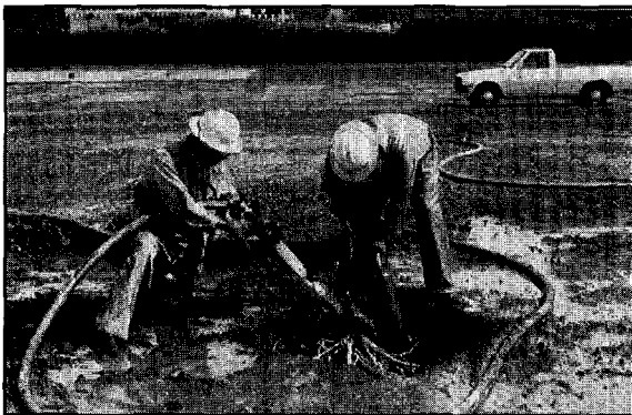
Figure 1. Hydroexcavation of tree roots with a high-pressure water and vacuum system.

were continuously aerated ( \approx 1 \text{ L} \cdot \text{min}^{-1} ). Each cutting was held in place in the lid of the container with rubber stoppers that had holes bored through them. This arrangement allowed the rooted cuttings to be held with only their root systems immersed in the aerated nutrient solution. Each