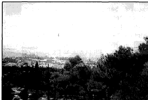
Figure 2. Urban forests: where the forest meets the city. Thessaloniki in Greece.

Initiative and financing for establishing urban forests largely followed the same trend as ownership. Feudal rulers and the upper-class were first responsible for this, followed by industrialists