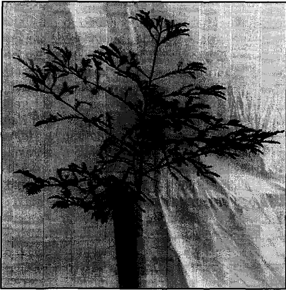
Figure 1. Redwood tree in treeshelter, 4 growing seasons after replanting.

distinct dry season from mid-April to mid-October with very little or no rain. The soil of the experimental field is heavy clay (about 2 ft [60 cm] deep) that was spaded and weeded by hand the day before planting. Exposed to full sun from 9:00 A.M. to 6:00 P.M., the experimental field has been fenced for protection from browsing deer and vandalism.