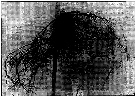
Figure 2. Side view of sheltered (top) and unsheltered (bottom) redwood root systems 4 years after replanting. Note the differences in root diameter and volume between 2 treatments. A displayed detail of fine roots demonstrates reliability of the Vector vacuum soil extraction technique for collecting data on tree roots.