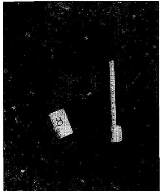
Figure 3. A bird's eye view of root architecture and distribution completed in 4 years by the unsheltered redwood (top) and the redwood grown in a treeshelter and subjected to S-schedule (bottom). The roots of the unsheltered redwood are more fibrous and longer, and radiate evenly in all directions. The roots of the treesheltered redwoods are conspicuously smaller (a 12-inch tape measure serves as a scale).