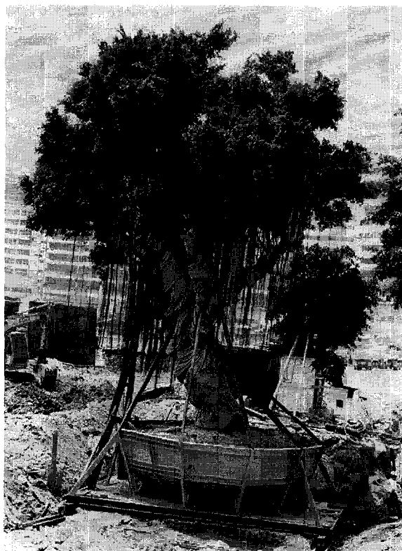
Figure 4. Tree A about 18 months after crown reduction. Note the regrowth of some foliage mainly as sprouts from cut faces, the base plate supporting the steel container, and the beams propping the tree.

reduction managed to trim only a small proportion of the load. Lifting was ruled out, and so the sledge method was adopted. Customary wrapping of the rootball using hessian or a wooden box could not handle the weight. A high-strength steel encasement was necessary instead. A container using 4 mm steel sheet reinforced by steel tubes, all welded together, was constructed at the time of root pruning (Figure 4).