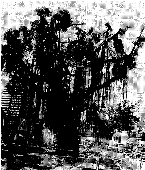
Figure 3. Tree A shortly after massive crown reduction. Note the loss of most foliage and twigs, and cutting down to major branches and limbs.

Crown reduction preceded root pruning. About half of the crown was removed quite drastically, including major branches and limbs (Figure 3). A sprinkler system to produce a fine mist was installed in the crown to reduce foliage temperature and dampen transpiration. The trunk and limbs were wrapped with hessian to lower temperature and the possibility of mechanical injury. Root pruning was phased over four stages, each dealing with a quarter, over two growing seasons (1993 and 1994). A 2 m deep and 1 m wide trench was dug manually at 4 m from the trunk, regarded as deep enough to encompass most roots, since Banyan