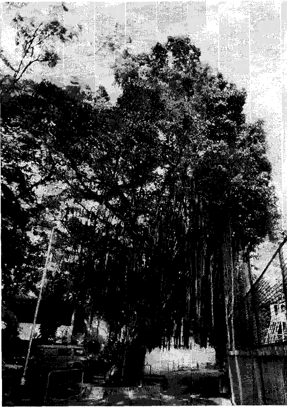
Figure 1. The beautiful tree A situated in a tree pit on the edge of the footpath in Sports Road photographed before crown reduction. Note the unusually abundant growth of aerial roots which bestow a unique character to the specimen.

the racecourse, in particular to upgrade the late-1840s race track to international and modern standards (Figure 2). A master plan to enhance the landscape and traffic conditions for the entire area was prepared. A tree survey identified 273 trees in the affected area, of which 87 were to be transplanted and the rest felled. The two Chinese Banyans in question were deemed by the Club's landscape consultant to be too big, too old and past their prime, and hence were earmarked for removal. They straddle the new race track, and suggestions to shift the alignment or accommodate the trees sympathetically into the design were rejected.