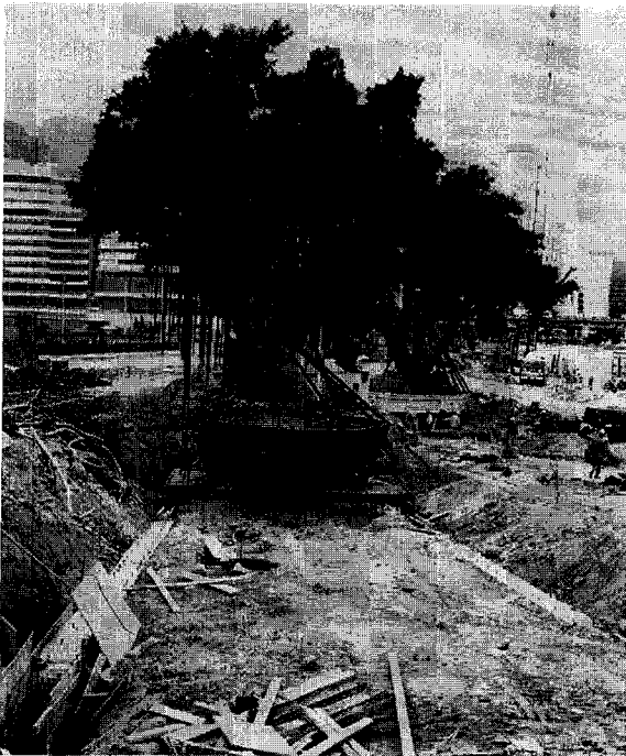
Figure 6. Tree A on the left and tree B on the right behind it immediately before the transfer. Note the construction of reinforced concrete rail bedding on which the tree would slide on rails towards the destination.

onto the bolts, and the set-up was pushed at the back (downslope side) by two powerful hydraulic jacks each capable of generating 38 Mg.