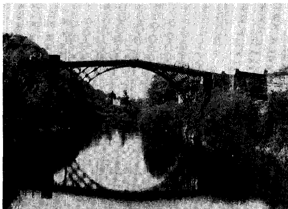
Fig. 1. Telford's 1779 iron bridge in Shropshire, England. The start of the British industrial revolution and the urbanisation of British society.

A price has been paid for this early industrial success. In 1986 over 175,000 acres of land, mostly around our towns, and don't forget that we are a small country, was classified as being in need of remedial treatment (We use the term "Derelict"). During the past twelve years in England alone nearly $1.5 billion has been spent