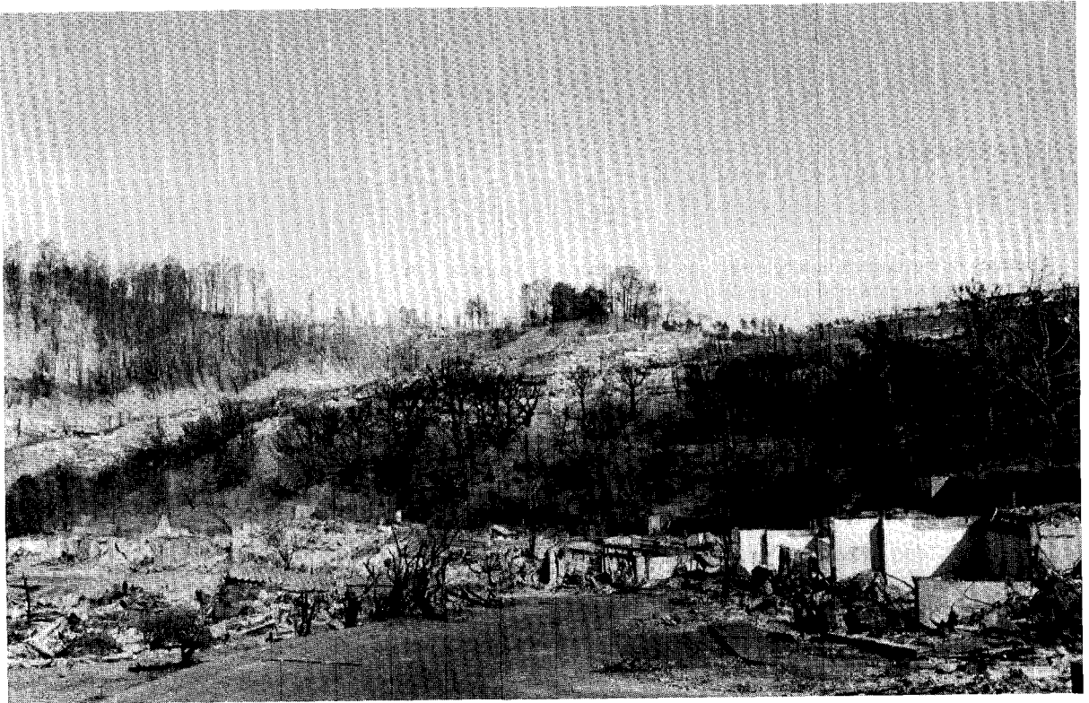
Fig. 1. A panorama of burned slopes with a few hundred houses destroyed. In this case, young groves of Eucalyptus globulus and Pinus radiata were both responsible for the swift conflagration. Notice that several hundred pines were improperly pruned (topped) for a view in front of house rows (arrow). This practice stimulated “mat-like” regrowth in the crown tops which denied light to the branches below, creating dead and highly flammable debris.