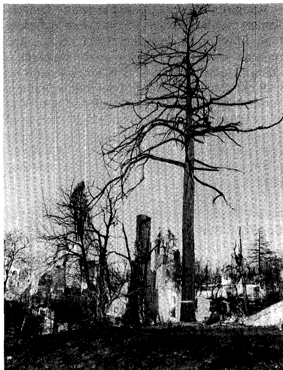
Fig. 4. A typical example of the ladder fuel configuration which helped to destroy a house. In its journey upward, the fire jumped the street, ignited Juniperus sp., spread up to Cotoneaster sp., followed by Prunus cerasifera , until it became a crown fire in Cedrus deodora . Walls collapsed, leaving a forest of chimneys.

- Thin trees by cutting branches so that crowns