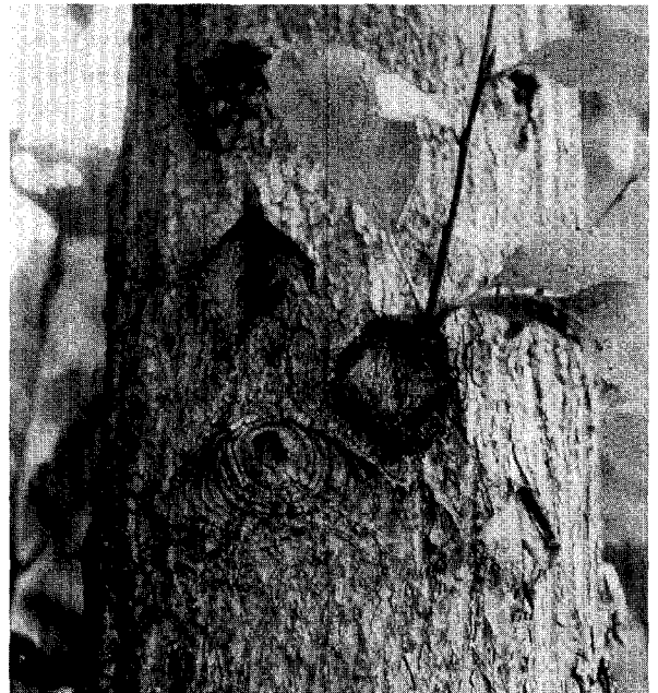
Figure 2. Wound healing in a poplar tree 1 yr after treatment. The upper untreated wound is still not completely closed while the lower two treated wounds have closed.

The Nectec paste in laboratory studies had a broad spectrum of fungicidal activity against these fungi. Because of this, spread of fungi in Nectec