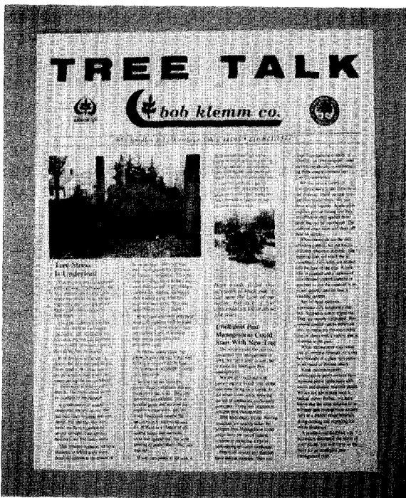
Figure 2. A close-up of the 2 pages, four color format, advocated by the author.

When possible, we recommend equating complex plant health concepts to corresponding human systems. When discussing fertilization, for