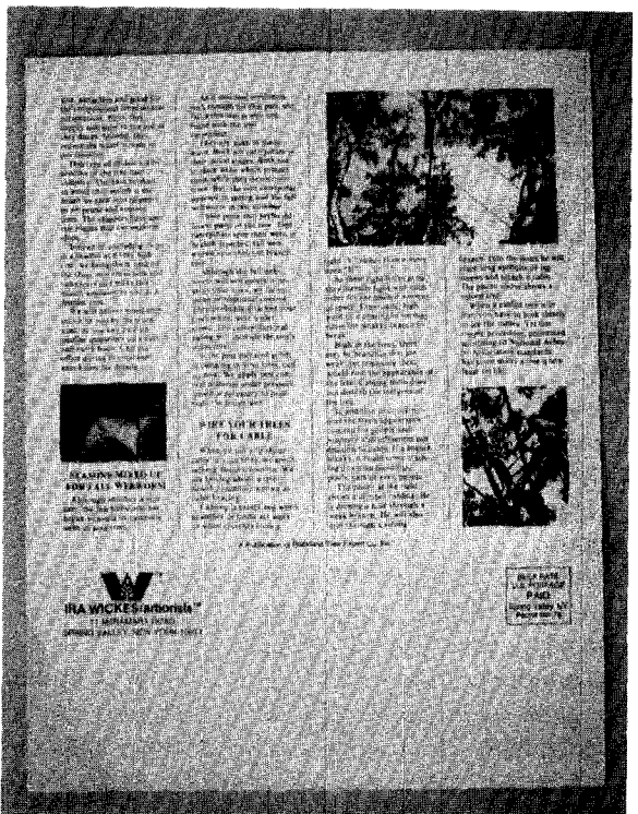
Figure 3. Further economies can be realized by making the newsletter a "self-mailer." With the bulk mailing permit printed right on the newsletter, the arborist only has to apply an address label.