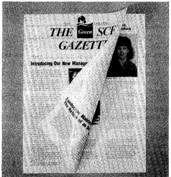
Figure 5. Four pages like this are warranted only if you have enough information on an ongoing basis. This arborist operates a full service landscaping and lawn care service as well as tree care company, and all services have to be represented.