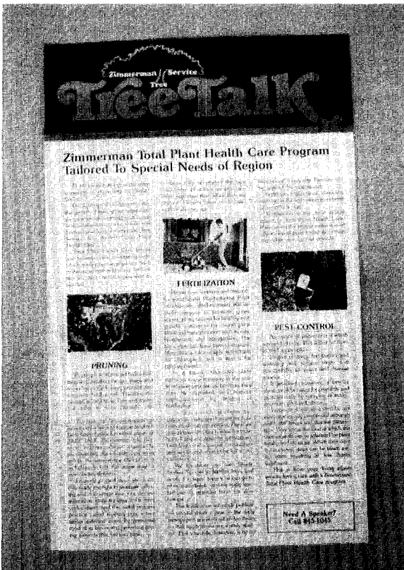
Figure 4. This newsletter has an attractive two-color masthead. The information and photos are then printed in black on a shiny paper. This arborist uses a three column format, allowing for bigger type. Extra copy is accommodated by using an 8½ X 14 sheet instead of the more standard 8½ X 11.

Publication frequency. The number of newsletters published per year should be governed by material and budget. Most of our clients publish twice a year, in spring and in fall. One publishes only in spring, another quarterly and another seasonally as tree care emphasis changes. Some arborists publish monthly, but this is a major investment in printing and postage. We