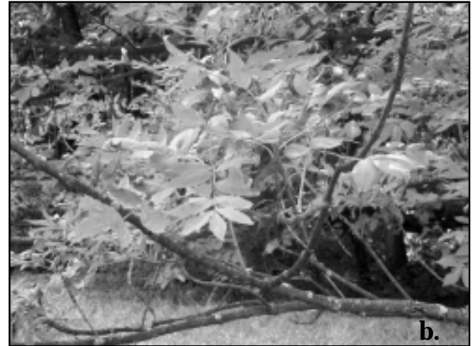
Figure 1. Ash tree showing foliar necrosis typical of anthracnose. The tree was assigned a disease severity rating of 5, indicating more than 75% of the canopy exhibited symptoms. (Note: Color photographs may be viewed online at www.mortonarb.org/plantinfo/plantclinic/phc/05-04-01.pdf )