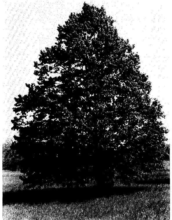
Figure 2. Typical profile of little-leaf linden showing longer branches on the north (left) side.

With more growth expected on the north side, planting locations might be shifted slightly to give proper clearance from sidewalks and wires. This is not necessarily true near buildings, since shading, reflected heat and light and other factors are nearly always altered by the structure itself. Higher drought stress on the south side of trees would seem to warrant more watering on that side