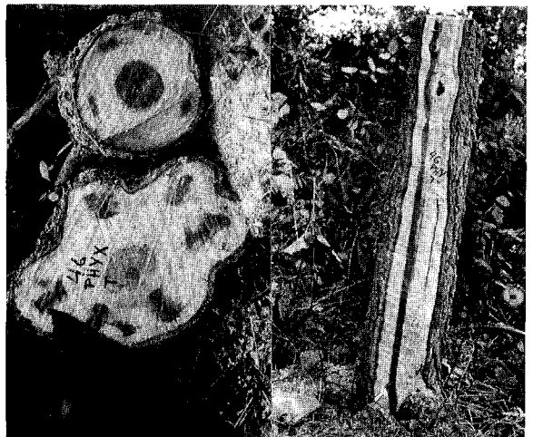
Fig. 3. Sections from a tree badly damaged by Phyton (HD). Left, cross sections at the root collar and 1 m above; right, sapwood discoloration extending from injection point (arrow) through the first 1 m section of the tree.