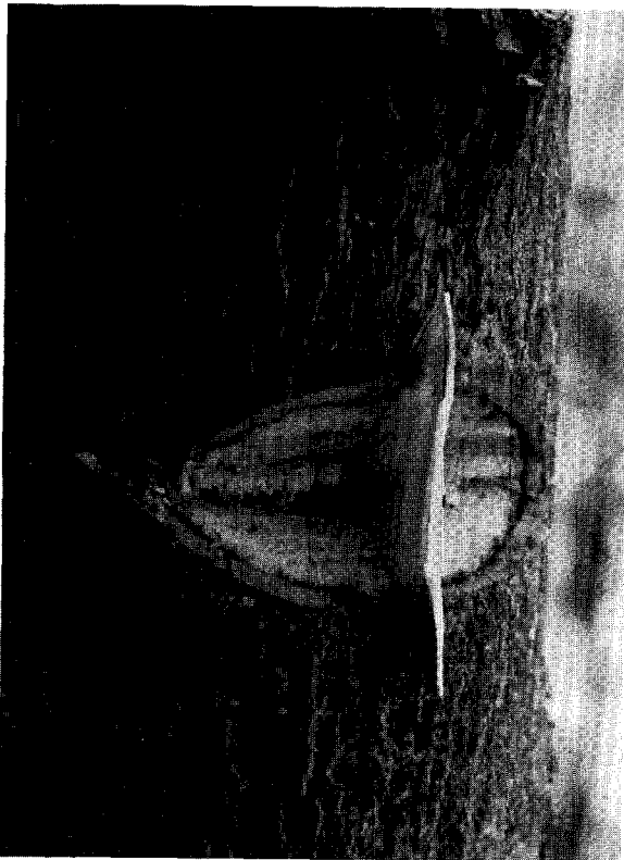
Figure 1. The Leben, Shigo, Hall Method of subdividing a wound by a triangular aluminum plate to accommodate a treatment and a control at each site.

The amount of discolored wood measured in the wounds of various treatments is presented in Table 1. Acidity per se had no effect on the amount of discolored wood; in red maple comparable areas of discoloration were measured in wounds of trees exposed to solutions of pH 3.0 and 5.8 (Figure 3) or pH 4.0 and 5.8 at points 0.5 or 2.5 cm above the wound. When rain was excluded from the wound by a plastic shield, the area of discoloration was similar to that found in the acidified wounds. In the ambient rain treatment (weighted mean, pH 3.98) the amount of