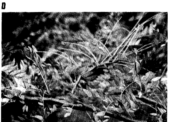
Figure 1. A. and B. Field shots of Gleditsia triacanthos inermis 'Majestic' ( O_3 resistant). Compare with C. and D. Field shots of 'Imperial' ( O_3 sensitive). Note upper leaf surface stipple and leaf drop on 'Imperial.' A. and C. were taken on August 17, 1983 and B. and D. on September 14, 1983.