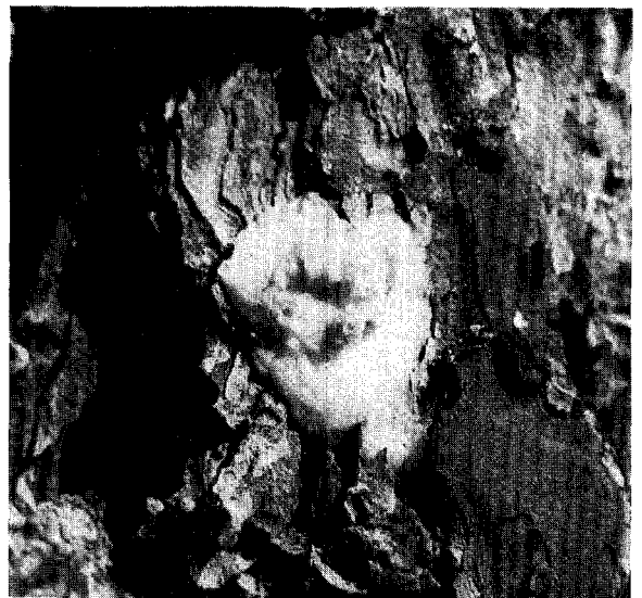
Figure 2. Pitch tube, the tree's response to southern pine beetle attack.

In later stages of SPB attack, if pieces of bark are removed, you will see S-shaped galleries on the inside of the bark. Ips cut either "Y"-, "I"-, or "H"-shaped tunnels in the inner bark. The black turpentine beetle larvae feed as a group and make a cave-like gallery. The larvae can consume as