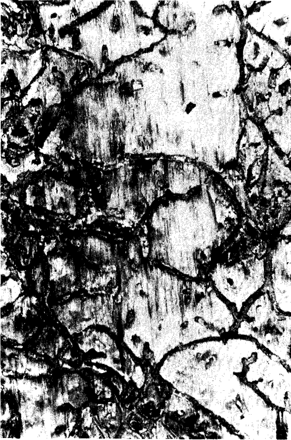
Figure 1. Winding or S-shaped galleries cut under the bark by southern pine beetle adults.