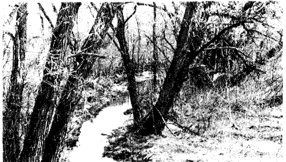
Figure 1. Scenes with highest average preference ratings (over 4.5 on 5-point scale).