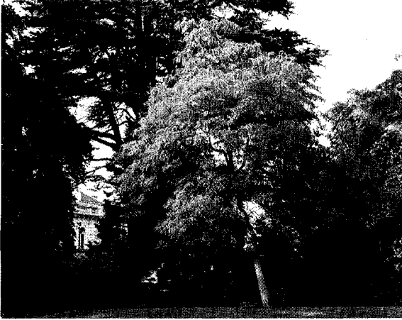
Fig. 3. Contrasting fine foliage of Juglans regia 'Laciniata'