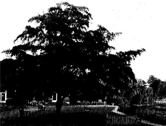
Fig. 6. Alnus glutinosa 'Imperialis' at Leamington Spa, England.