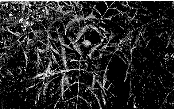
Fig. 4. Cut-leaf leaflets and fruit of Juglans regia 'Laciniata'.