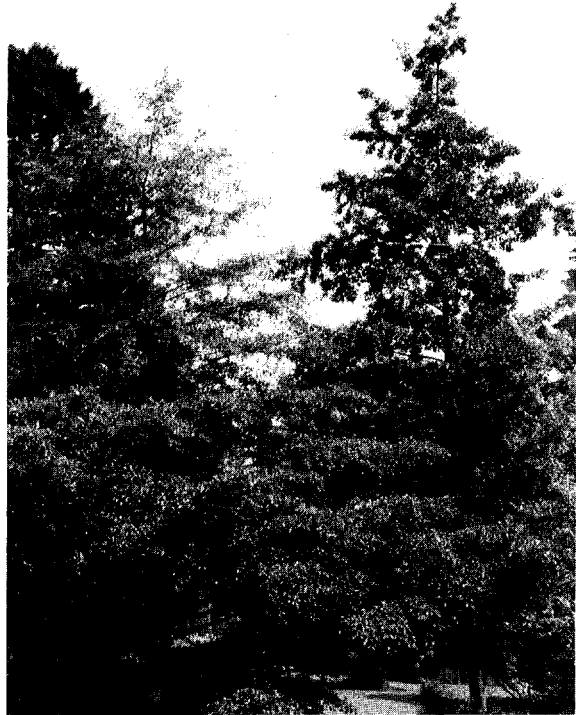
Fig. 5. The 'cut-leaf' alder, Alnus glutinosa 'Incisa', growing with the Italian alder, Alnus cordata at Batsford Park, England.