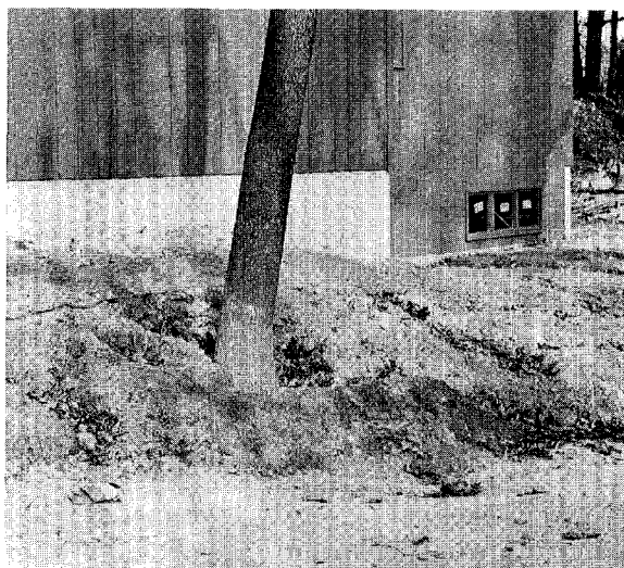
Figure 2. Injury from raising the grade around an established tree during house construction.

It is in the artificial ecosystem of urban shade trees, sometimes referred to as the "urban forest" that stress levels often reach a lethal magnitude. Unfortunately this is precisely the environment where trees are most needed to improve the quality of life in towns and cities (Tattar, 1978). The problem, therefore, is how to grow trees and preserve their health in hostile environments where high levels of urban stress, such as restricted root space (figure 1) and construction injury (figure 2) are everpresent. If we examine a