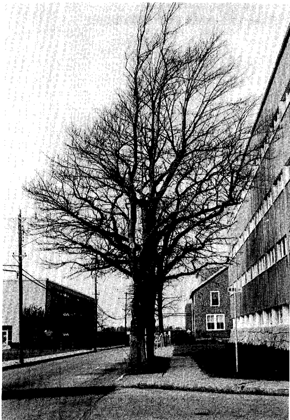
Figure 1. Urban shade tree growing in conditions of restricted root space.

Stress can be defined as a detrimental force or