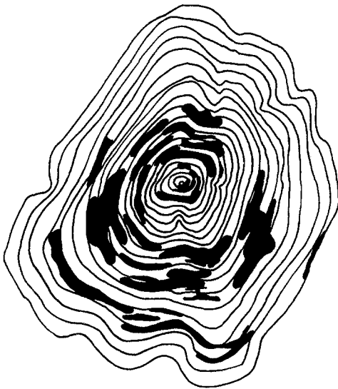
Figure 1. Schematic diagram of carpenter ant nest workings in a cross-section of a trunk. Note that the gnawed out portions follow the general pattern of the growth ring.

Effects of carpenter ant nesting on shade trees. Because a high percentage of urban shade trees are used as nesting sites by carpenter ants, their nesting activity poses several problems. In forests, carpenter ant nests have been implicated as contributing to wind breakage (Graham 1918; Felt 1928; Schread 1952). The effect of tree size and carpenter ant nesting on wind breakage has recently been documented for urban trees (Fowler and Roberts 1982). However, unless the tree is highly exposed, and nest excavations are extensive, wind breakage should not present a substantial problem, as the incidence of wind breakage of trunks and major limbs is not high. However, in exposed situations where wind