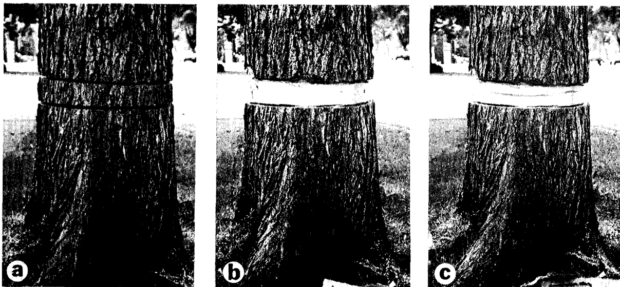
Fig. 2. Girdling process: (a) initial parallel cuts made with a chain saw to girdle a diseased elm, (b) sapwood removed from between the initial saw cuts, and (c) a third cut made into the wood to assure vessels are severed.

but not significantly less, than those sustained under the prompt-removal treatment. However, by the third year, 1976, a statistically significant difference was generated. If the experiment had ended in 1975, this improved performance would not have been detected. Only through Barger's conscientious, sustained effort were we able to realize that this strategy pays off by reducing elm losses. The beneficial effect of girdling, though insignificant at first, builds over time.