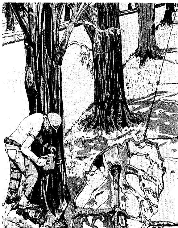
Fig. 1. A diseased elm being girdled to disrupt root-graft transmission of the fungus to adjacent elms.

which each diseased elm detected was immediately girdled and subsequently removed within 20 work days.