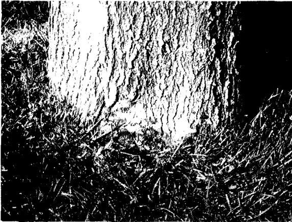
Figure 2a. Basal trunk canker associated with Fusarium sp. Small cracks in the bark are discernible near the soil line.