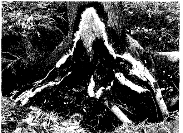
Figure 3b. Dying cambium and discolored wood, or "collar rot" was observed when the collar area was excavated and the bark removed.