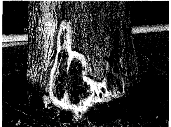
Figure 2b. Dead cambium and discolored wood under affected bark of the basal trunk canker. Fusarium was associated with this canker.

regular in shape and may have resulted from the coalescing of several smaller cankers. On one tree, there were as many as 37 small cankers within an area of approximately 225 cm 2 at the root collar.