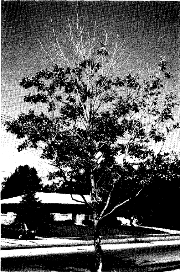
Figure 1. Sugar maple in advanced stages of decline. Upper branches had exhibited smaller leaves, heavy seed set, and premature coloration for several previous years.