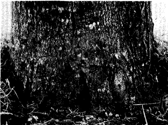
Figure 3a. Collar rot associated with Phytophthora citricola . Loose bark over dead cambium has remained in place at the base of this Class II tree.

Examination of trees with maple decline symptoms (Classes II-V) revealed progressive development of basal canker and collar rot. The extent of trunk girdling by basal cankers and collar rot, occasionally found on the same tree, was greatest