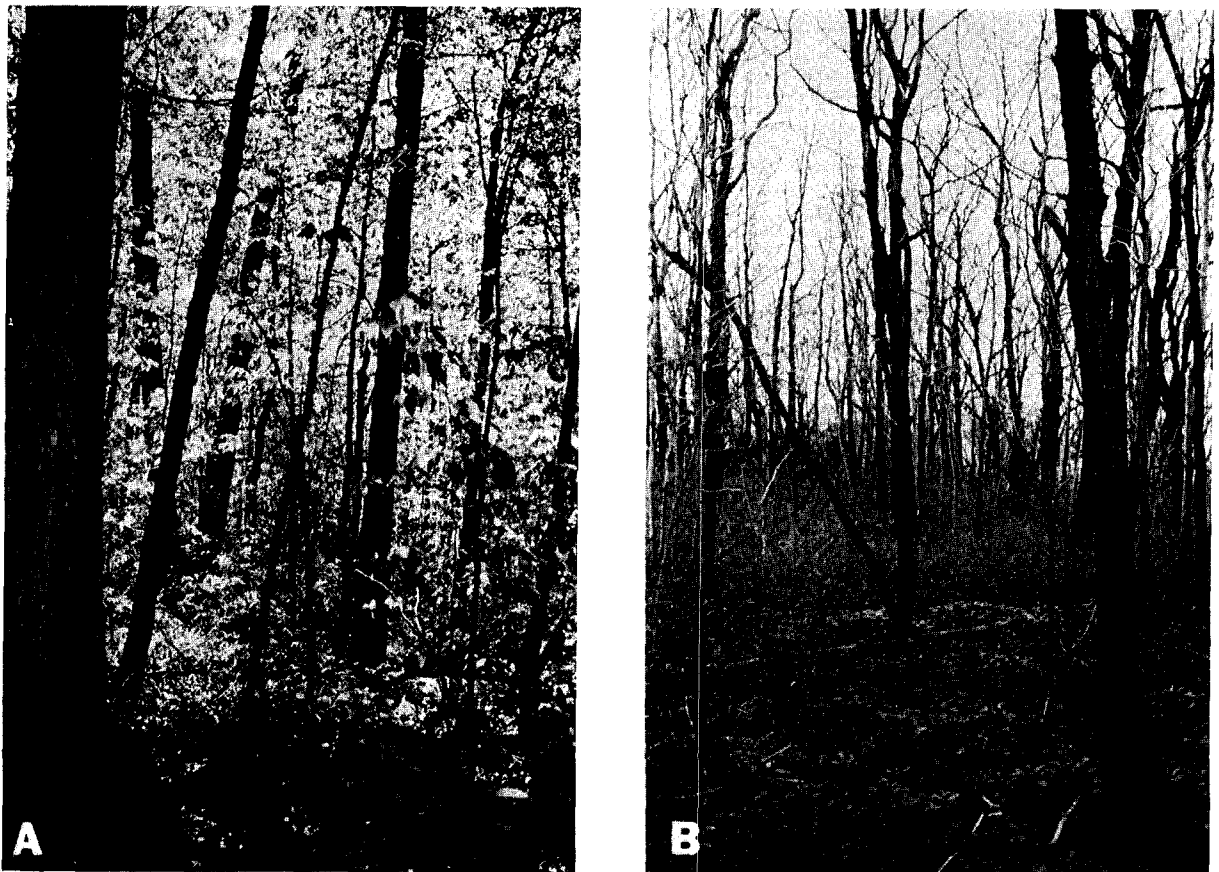
Figure 2. (A) Ground view of a gypsy moth infested area treated with Bt . (B) Adjacent untreated area.

Bt is environmentally and ecologically less destructive than chemical insecticides. With food crops, Bt can be used up to the day of harvest and has no entry restrictions. Bt does not have any effects on honeybees. Parasites and predators, which may well influence the population density of the pest in following years, are not affected. These are important considerations where residues must be minimized, as around reservoirs and in watershed areas.