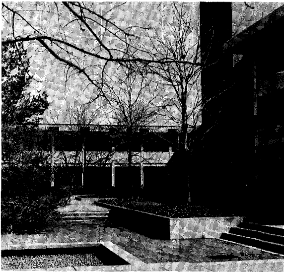
Fig. 2. Trees growing in an urban situation where buildings and pavement modify microclimate.

Buildings and Shade Structures. The microclimatic effects afforded by buildings provide tree planting sites similar to those along forest edges, but without the problems caused by tree competition (Fig. 2). For many trees, the east side of a building provides optimal conditions for rapid early morning foliage drying, and affords protection from excessively high temperatures. Shade structures, such as lath roofs over patios, can provide protection for young, disease-susceptible trees. If desired, the leaves of tree seedlings in the nursery can be kept completely dry at all times by growing the seedlings in inexpensive plastic "tunnels" (Keveren 1974).