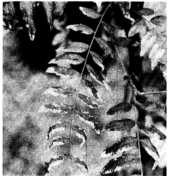
Figure 2. Marginal and interveinal, bifacial necrosis on Gleditsia triacanthos inermis 'Skyline' leaves one week after a 7½ hour fumigation with 1.00 ppm sulfur dioxide.

From monthly observations during the past three growing seasons at the Rikers Island and Cary Arboretum sites, and during the past two growing seasons at the Rutgers and New York Botanical Garden sites, it was evident that the most common type of air pollutant injury symptom present at all four sites was upper leaf surface stipple (flecking) characteristic of ozone (or oxidant) injury. While it is difficult to verify pollutant injury in the field, evidence from this study suggests that ozone (or oxidant) injury was common to a few cultivars at each of the four sites. First, the foliar symptoms in the field were nearly identical to those caused by the chamber fumigations with ozone. Second, only cultivars determined to be ozone-sensitive (in the chamber tests) showed foliar symptoms in the field. None of the ozone-tolerant plants was visibly affected by the field ex-