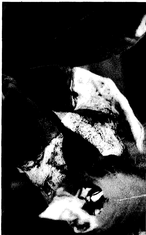
Fig. 3. Scorched or burned appearance of leaf-tip with the later stages of B toxicity on Rhododendron × Catawbiense .