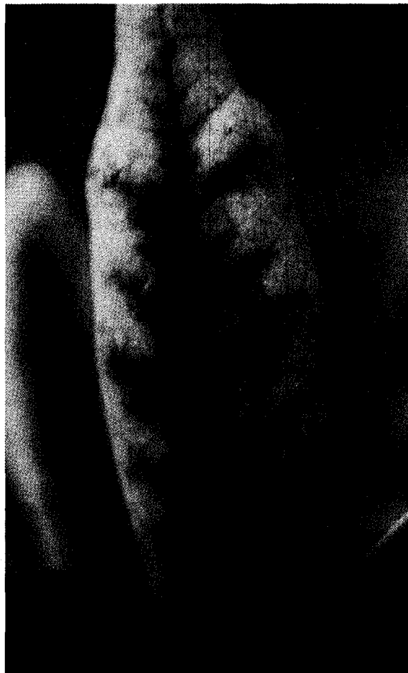
Fig. 2. Marginal chlorosis caused by B toxicity on Rhododendron x Catawbiense .

B. In many cases, total B may exceed 2 grams per container when all additives are considered.