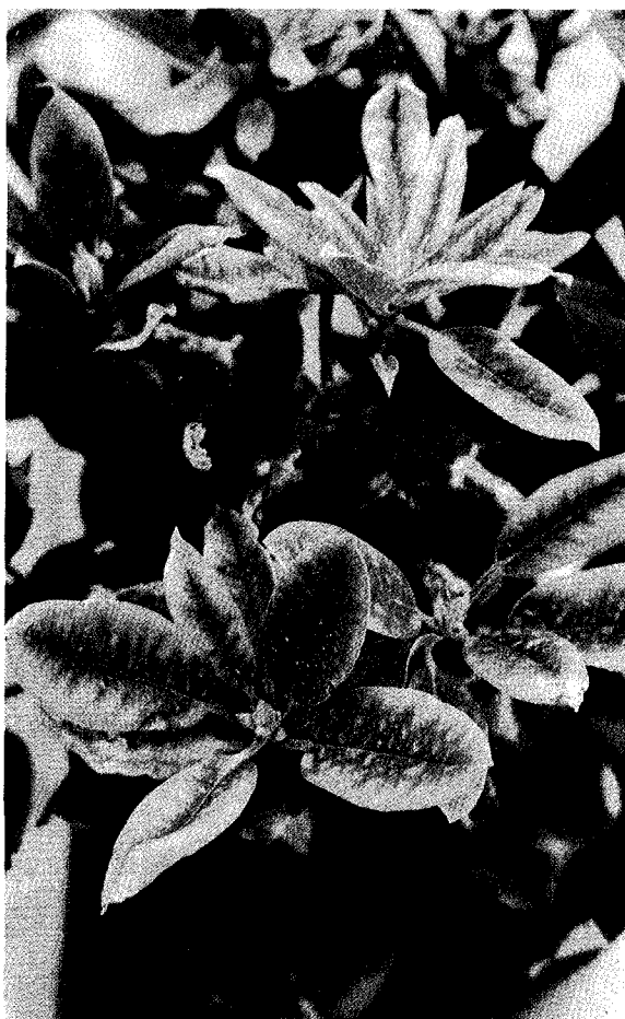
Fig. 4. Dwarfed leaves arising from shortened internodes on Rhododendron as a result of B toxicity on Rhododendron × Catawbiense .