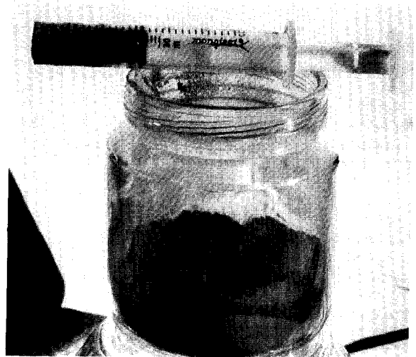
Fig. 2. A 3 ml plastic syringe with the tip end removed to facilitate loading with powdered ferric citrate.

In 1977, parkway pin oak and sweet gum trees were treated. Six types of Medicap treatments