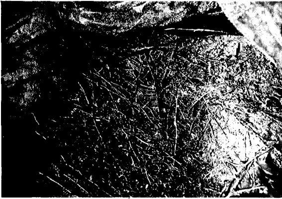
Figure 2. Many fine roots were observed in the interface between plastic and soil on all species.

tough, drought-resistant species, may restrict growth. Black plastic beneath the mulch made little difference in weed problems and provided no additional benefit to the plants compared to mulch alone.