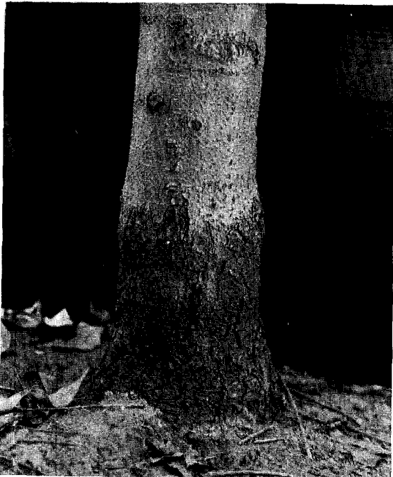
Figure 1. Fraxinus uhdei first trunk bark banded when 5 yr old and repeated for 3 consecutive years. An increased development of mature bark characteristics as well as irregular cortex growth is shown.

Trees which were 5 yr old when first treated have received yearly banding for 3 or more yr. This has demonstrated a yearly recovery from the growth inhibition and the need for retreatment as well as a lack of tree decline even on younger more sensitive trees. Fraxinus uhdei showed increased development of corky bark in the treated zone as well as an irregular increase in caliper under these repeated bandings on young trees (Figure 1). Fraxinus uhdei which were 15 yr old when receiving the first of 3 banding applications have shown no change in bark or trunk growth (Figure 2).