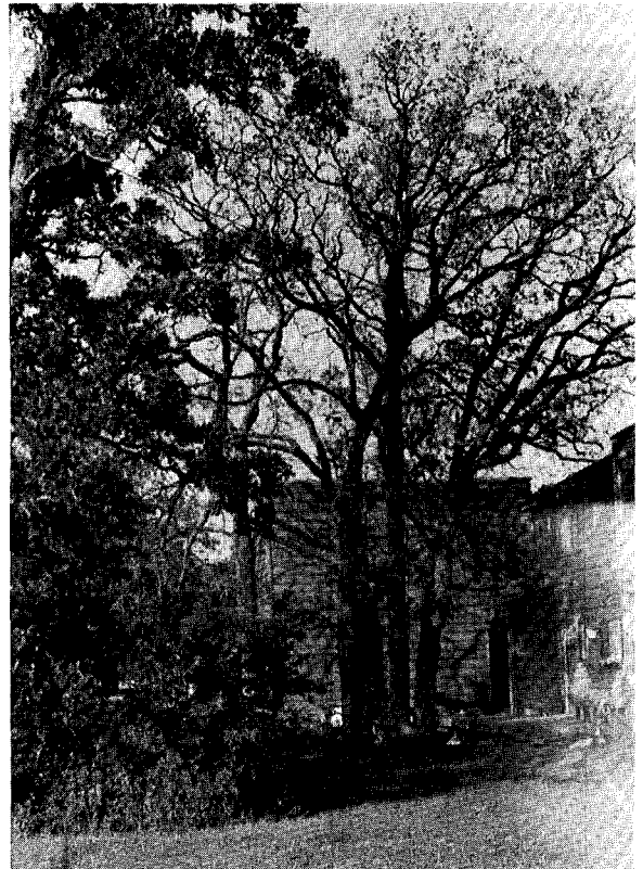
Fig. 1. Ditching for underground utilities was the apparent cause of loss of this group of post oaks which will not afford expected shade to this Texas home.