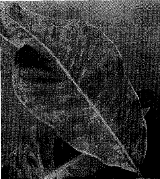
Fig. 4. Spider mite webs

Interior garden spaces in shopping malls, corporate headquarters, and banks are a part of modern living. Better use of natural light and spot lighting, better selection of plant material, and a better understanding of the plants requirements in a critical environment will inevitably produce a better landscape for both client image and employee morale.