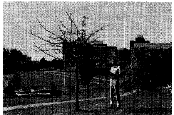
Figure 1. Severe chlorosis in pin oak resulted from planting a good tree on the wrong site; information from performance tests can assist arborists in making the proper choice, and thus to avoid such problems.

Still another category of testing should not be overlooked. Research specialists sometimes use chambers with controlled environments or special techniques such as inoculation with pathogens for refined studies of tree reactions. This kind of test usually is conducted for a highly specialized purpose, which may provide practical information to arborists, but cannot substitute for testing in "the real world."