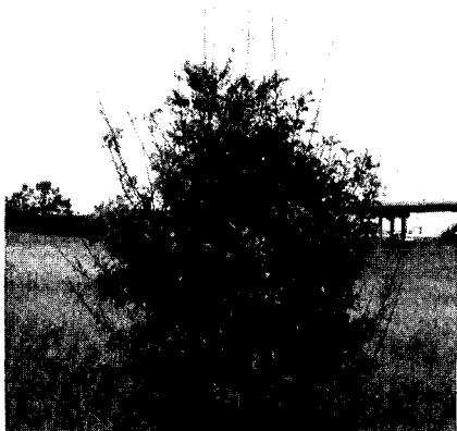
Figure 3. Crabapple showing extensive tip dieback.

Plant injury was evident as far as 150 to 200' from the highway's edge along Chicago free-ways. Langille reported Na was significantly increased to distances of 50 feet from the highway's edge after one salting season while soil Cl was increased to a distance of 200 feet. Sodium and Cl significantly increased to distances of 200 feet in Tsuga canadensis (L.) Carr, Canadian hemlock, needles after one winter. Williams and Moser (31) have shown that regardless of the rate of deposition, plants will be injured if exposure time is sufficient and that uptake of Na and Cl is linear with time (Figure 3). When tissue Cl levels reached approximately 2.7 percent, visual injury was manifested. Their work indicated that whether plants receive salts in low levels or high levels they will exhibit injury symptoms when the tissue Na or Cl concentrations reach a threshold level.