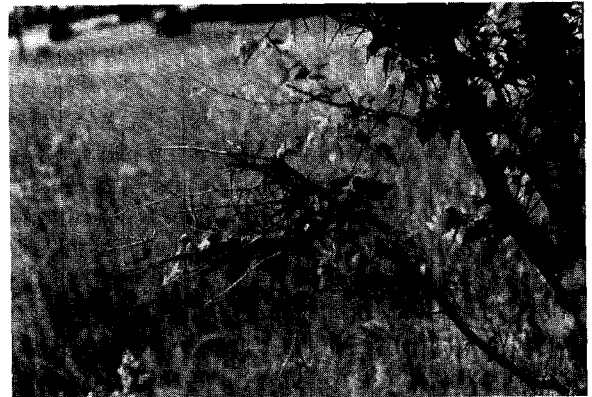
Figure 2. "Witches Broom" on hawthorn caused by dieback of the terminal and the subsequent development of many lateral branches beneath the dead area.