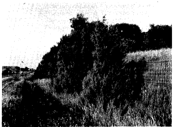
Figure 4. Eastern redcedar approximately thirty feet from the highway edge exhibiting dieback and one-sided habit.

Sodium and Cl accumulate in different amounts in various species (Table 2). The visual injury and degree of salt tolerance correlated closely with the shoot Cl levels. Hedera was more salt tolerant than Viburnum > Pyracantha > Coleus > Cercis . Chloride levels which induce toxicity symptoms in plants are difficult to compare because of the conditions under which the plants were grown and the tissues sampled. Tissue Na and Cl