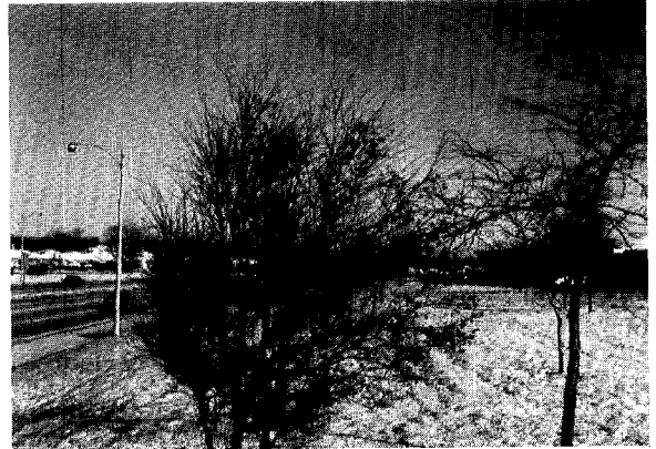
Figure 1. Hawthorn showing typical one-sided effect due to aerial deicing salts. Note fruit on the side away from the highway and the extensive "brooming" on the side closest.