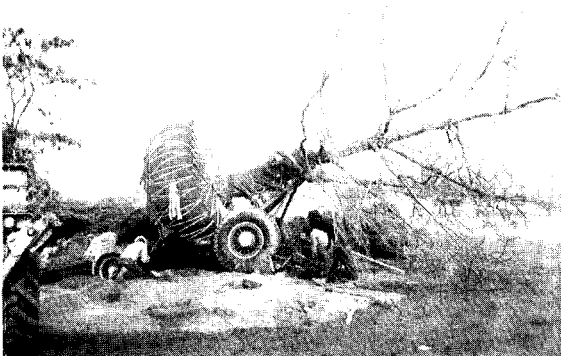
Fig. 5. A 14-inch honey locust lifted from the transplanting site.