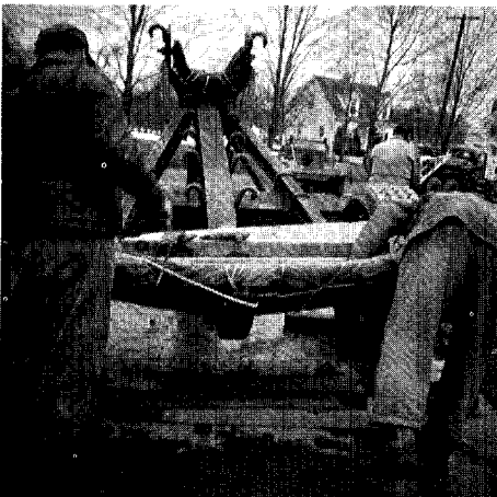
Fig. 1. The pan of the mover is being prepared prior to loading.