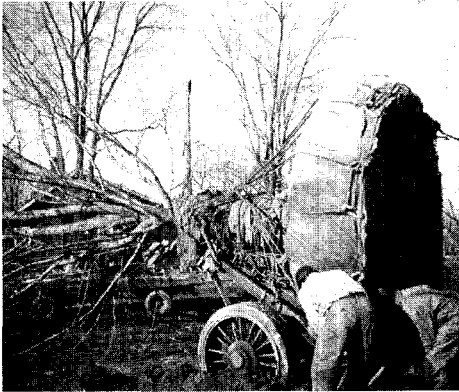
Fig. 3. A maple tree is lashed onto the pan of the mover.