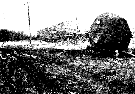
Fig. 7. A 10 x 12 foot ball resting on the tree mover.