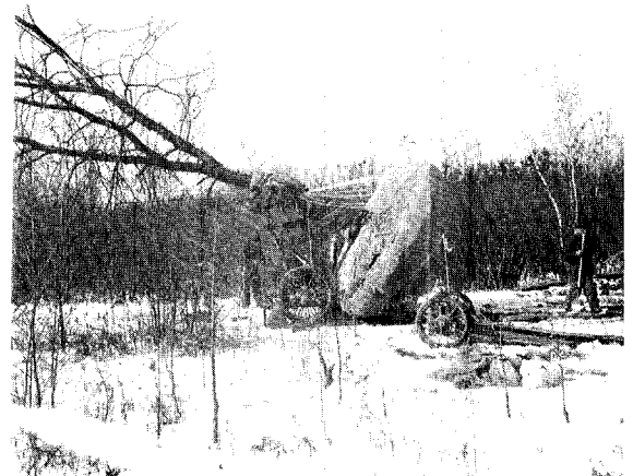
Fig. 2. A locust tree is lashed onto the pan of the mover.