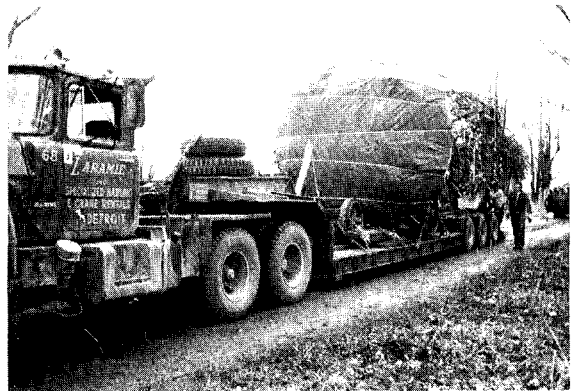
Fig. 8. The tree mover loaded on a trailer for transporting over highways.