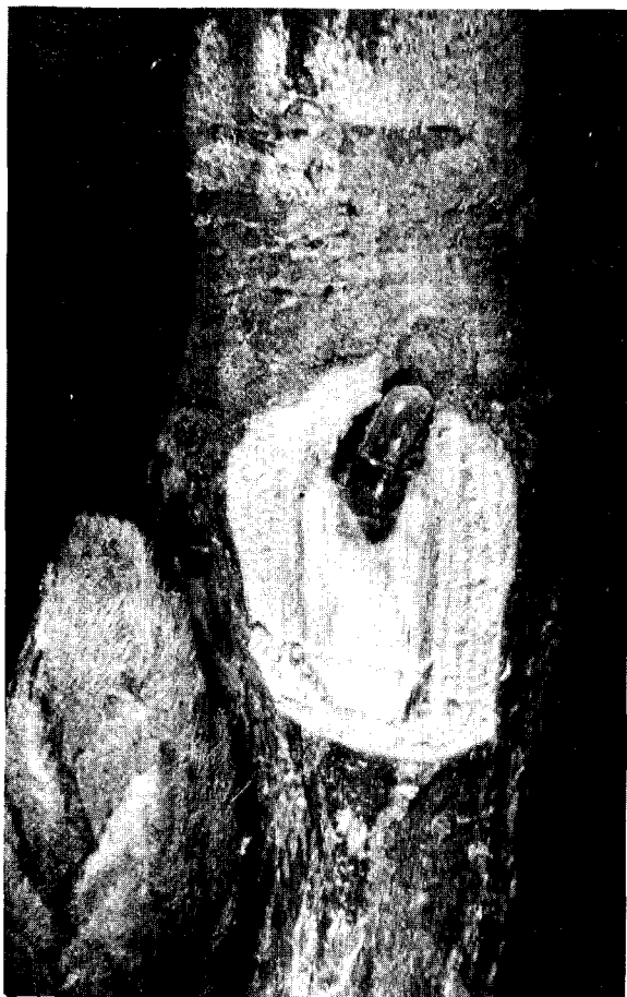
Figure 3. P. pruinus feeding on scarlet oak.

sented by Himelick et al. (1954), Jewell (1954), McMullen et al. (1955), and Thompson et al. (1955). Because the sap-feeding beetles are dependent on mycelial mats of the fungus on diseased trees and fresh wounds in the bark of healthy trees for successful transmission, they cannot be considered as a primary vector in the absence of one of these factors. In Missouri, mats seldom form on wilt-killed trees; yet the disease is well established, and each year new infections occur that can be attributed only to overland spread of the fungus.