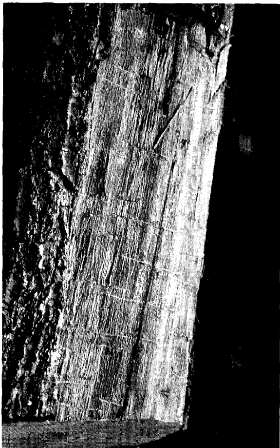
Figure 1. P. pruinusus egg galleries in diseased oak.

Other Coleoptera that commonly infest wilt trees are the two-lined chestnut borer, Agrilus bilineatus (Web.); the flatheaded apple tree borer, Chrysobothris femorata (Oliv.); the Columbian timber beetle, Corythlus columbiana (Hopk.); and several species of ambrosia beetles and other wood borers.