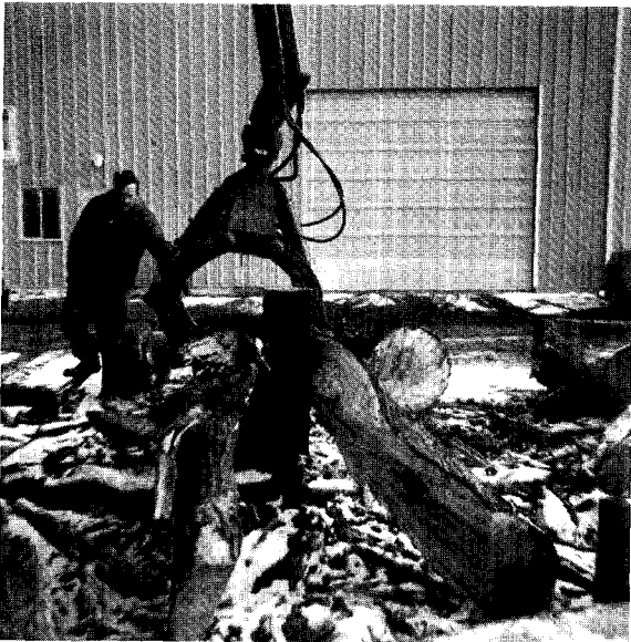
Figure 1. The log splitter operated by Ray Hutchinson at the Brush and Log Facility of The City of Toledo, Ohio.

Solid Logs. For use as playground equipment, sales to sawmills, etc. The facility officially opened for general use in May of 1971.