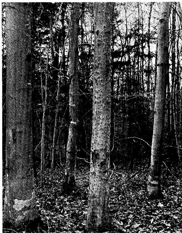
Fig. 3. The beech on the left is free of the disease. The two trees on the right are infested and infected severely.

Camp (1, 2) attributed this resistance to certain intraspecific varieties of beech and to an admixture of intermediate varieties that are not equally attacked by the insect. He said that no variety is immune, but that there are differences in the type of attack by the insect and fungus and in the response by the host. Of the three basic types of beech, he lists red beech as most susceptible, white beech as intermediate, and northern gray beech as least susceptible. Camp characterized