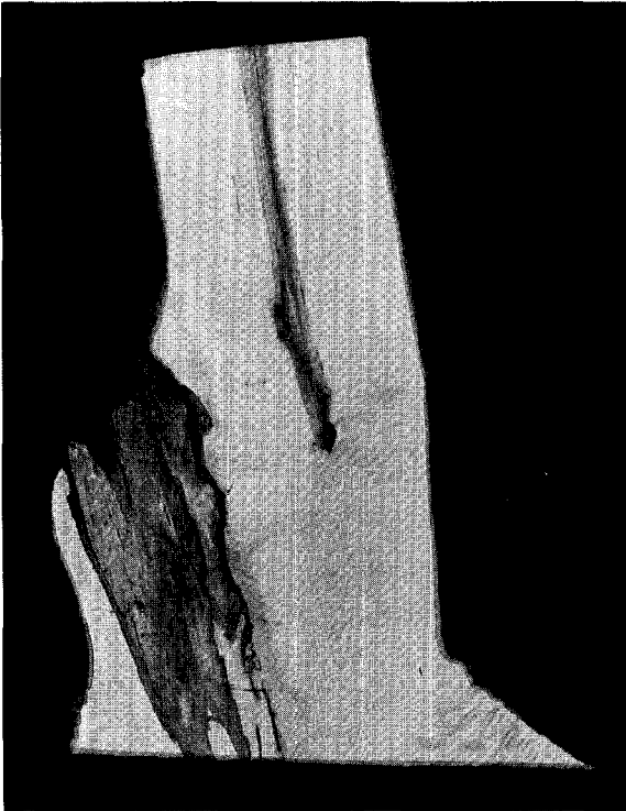
Figure 2.—Dissection of a maple with a dead basal sprout. The decay in the sprout stub was compartmentalized, and it did not spread into the main trunk.

When thinning young trees, use branch-stub healing as an indicator of healing potential. Select for removal those young trees that have poorly healed stubs.