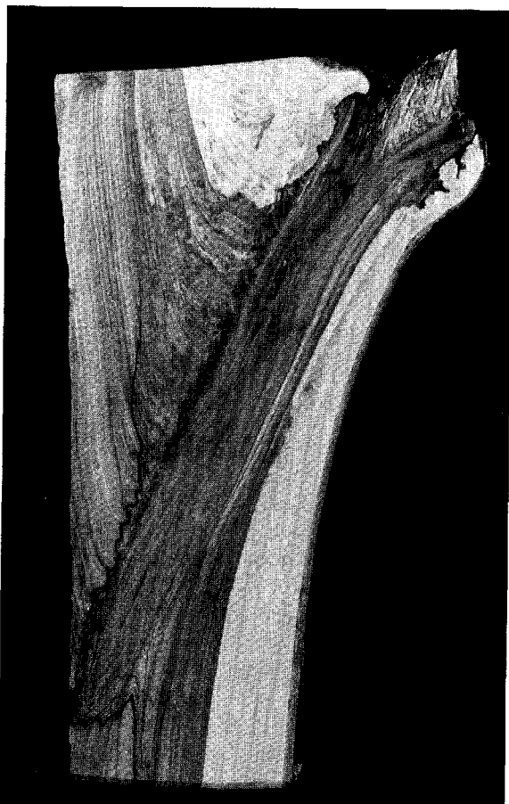
Figure 1.—Dissection of a poorly healed large branch stub on a paper birch. Poorly healed stubs are major external indicators of decay.

Before considering the steps for wound treatment, consider first the healing history of the tree by observing old mechanical wounds and old branch stubs and pruning cuts. A tree that has healed old branch wounds rapidly will usually heal new wounds rapidly. The opposite is also true.