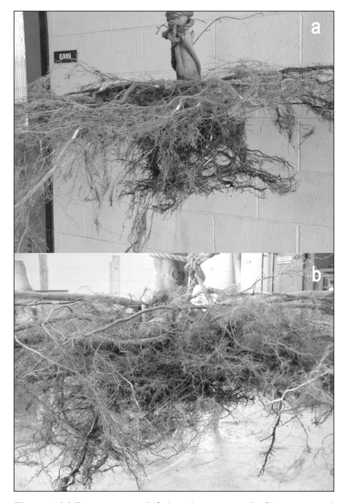
Figure 3. (a) Root system of 'Celzam' tree grown in C1 compacted plot clearly illustrating the location of the original root system within the 13 L pot. Much of the root system seems to be growing within the top 15 cm of the soil, just beneath the mulch, supporting findings from Gilman et al. (1987). (b) Root system of 'Celzam' tree growing in non-compacted soil plot illustrating a spreading root system, and no anecdotal evidence of root growth only beneath the mulch.

The majority of cultivars that received the standard rate of production nitrogen (100 mg·L<sup>-1</sup> N) had larger LA, LDW, and larger SDW than trees treated with the low rate (25 mg·L<sup>-1</sup> N) each year of the study, under all compaction treatments. Exceptions were 'Bowhall,' 'Morgan,' and 'October Glory,' which were unaffected by production nitrogen rate in any year. There was no interaction between N rate and soil treatment, therefore it is unlikely that the standard rate of pre-plant production N rate affects tree establishment in similarly compacted soils.