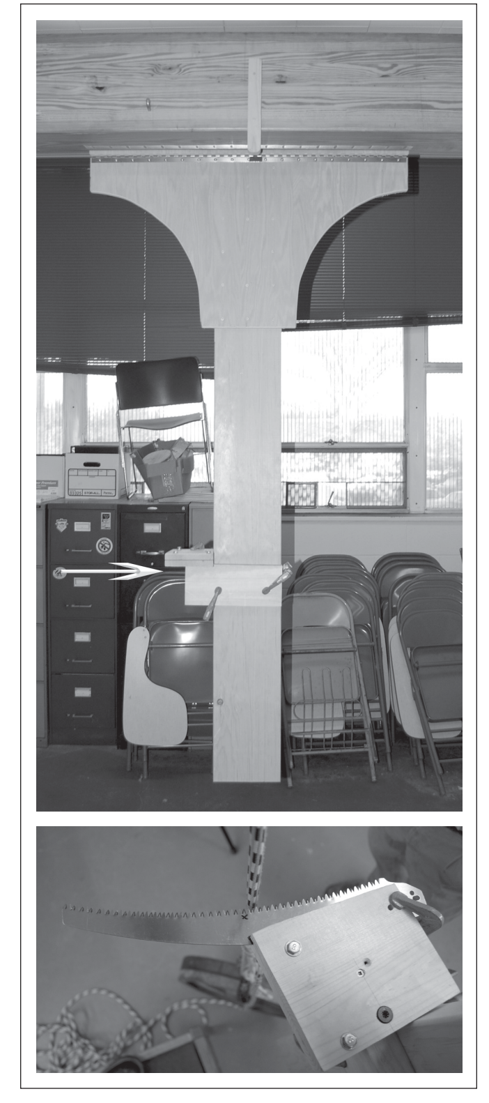
Figure 1. Experimental setup: (top) pendulum attached to beam, the arrow points to the jig that held blades; and (bottom) a closeup view of the jig, where the "X" marks the tooth that first made contact with the rope.

levels of the subordinate main effect (as determined by F-value) within each level of the dominant main effect. Then the 'con-