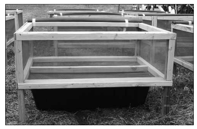
Figure 2. Mesh enclosure setup for containment and collection of Emerald Ash Borer adults in outdoor treatments.

of the logs to sustain a second generation or EAB with a 2-year life cycle or a second generation.