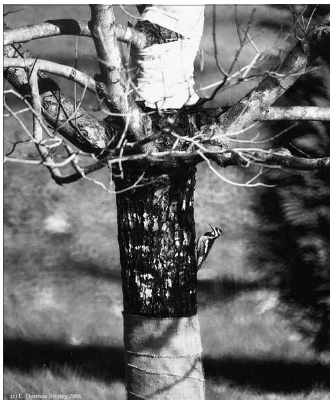
Figure 4. Sapsucker ( Sphyrapicus varius ) feeding on control treatment between tree wrap (top) and burlap (bottom) of Acer saccharum stem.

Although trunk wrapping did protect treated trees, it is a very time-consuming operation and the treatment could be considered unsightly by many consumers. Further study is needed to find effective treatments that can be applied more rapidly.