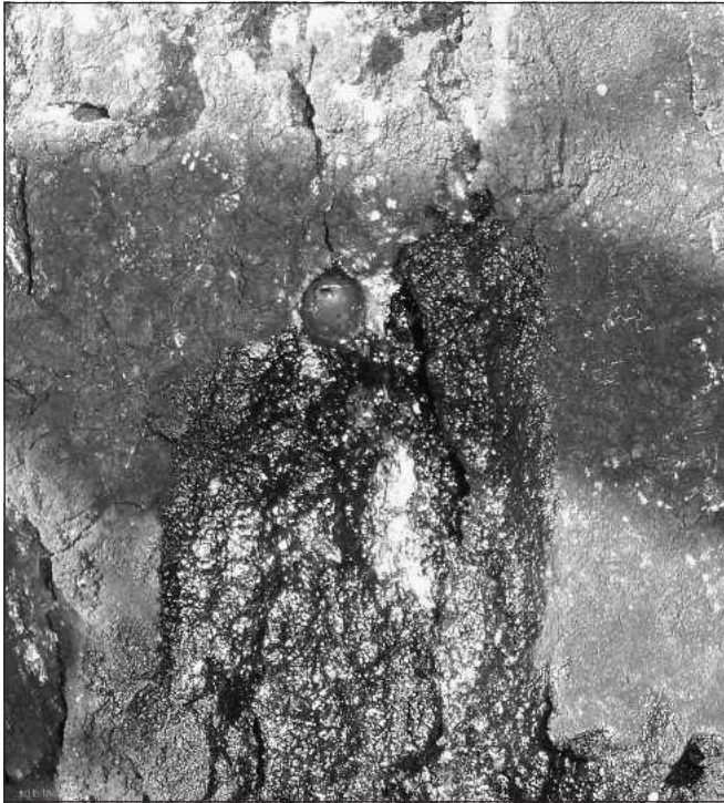
Figure 1. A bleeding wound in the bark of sugar maple ( Acer saccharum ) created by sapsucker ( Sphyrapicus varius ).

March 2006 by counting the active and bleeding wounds on each treated and untreated section of stem. After treatments were removed on 11 March 2006, all previously covered areas were inspected for the presence of previously undetected sapsucker damage.