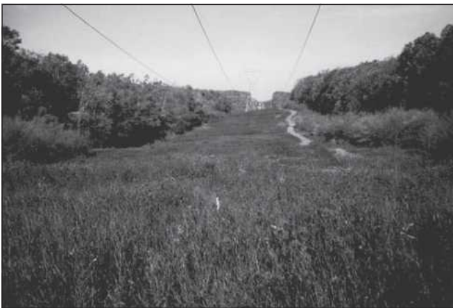
Figure 2. A northerly view of the right-of-way on the State Game Lands 33 Research and Demonstration Area, Centre County, Pennsylvania. In the foreground is a basal low-volume spray unit showing the foliage of black chokeberry ( Aronia melanocarpa ). The flagging is the location of a permanent plot used for vegetation transect establishment (photo by R. Yahner, early November 2005).

Forest cover type was located 50 m (165 ft) adjacent to the ROW (near a handcut and a basal low-volume spray unit); dominant trees were chestnut oak ( Quercus montanus ), northern red oak ( Quercus rubra ), white oak ( Quercus alba ), and black oak ( Quercus velutina ). Tree sprout cover type was produced by a handcut unit with common tree species being chestnut, northern red, white, black, and scrub ( Quercus ilicifolia ) oaks and black cherry ( Prunus serotina ). Tall shrub cover type predominated in border zones of several treatment units, e.g., mowing plus herbicide, with a dominant tall shrub of witchhazel ( Hamamelis virginiana ). Short shrub cover type commonly occurred in wire zones of some units, e.g., basal low-volume spray, and the principal plant species were blueberry ( Vaccinium vacillans and Vaccinium angustifolium ), huckleberry ( Gaylussacia baccata ), and sweet-fern ( Comptonia peregrina ). Cane thicket cover type was present in pure stands of some wire zones, e.g., basal low-volume spray, and the major species was common blackberry ( Rubus allegheniensis ). Forb-grass cover type was common in wire zones of mowed plus herbicide units; major species included goldenrod ( Solidago rugosa and Euthamia graminifolia ), hayscented fern ( Dennstaedtia punctilobula ), and poverty grass ( Danthonia spicata ). Grass cover type was present in wire zones of some units treated with mowing, which often contained dense stands of tall meadow fescue ( Festuca elatior ).