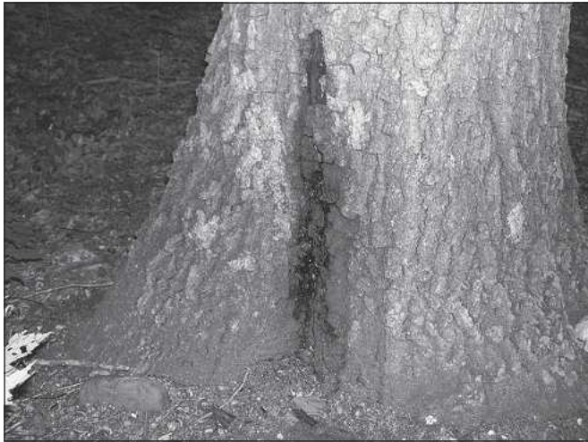
Figure 3. Bleeding canker on oak typical of symptoms caused by Phytophthora species.

P. citricola to successfully reproduce similar symptoms on oak (Figure 3).