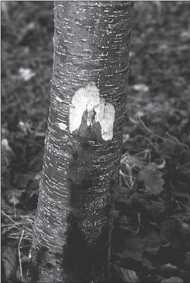
Figure 4. Bleeding canker on alder caused by unidentified Phytophthora species.

will hopefully lead to an increase in research and subsequent understanding of these diseases.