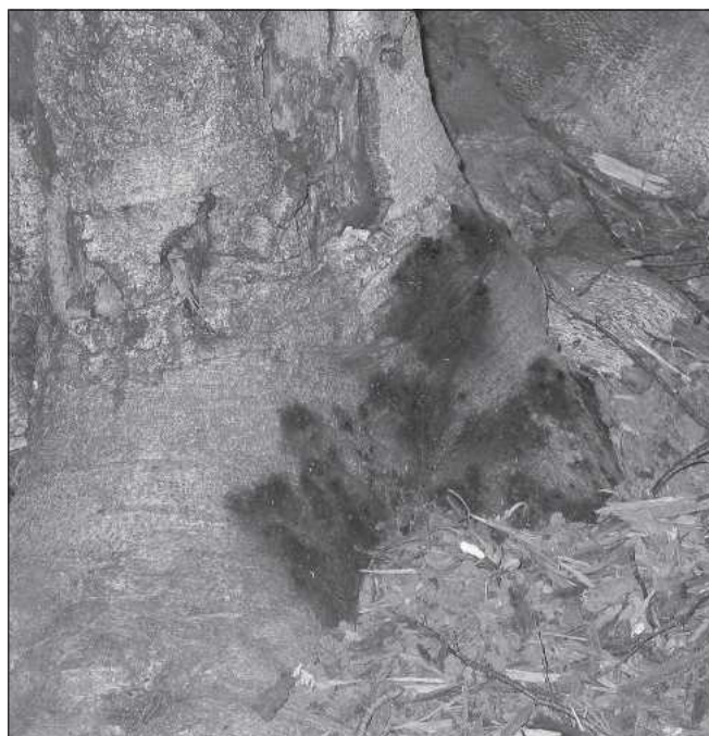
Figure 2. Bleeding canker of European beech caused by Phytophthora citricola .

A closely related bacterium, Brenneria nigrifluens , causes shallow bark canker of walnut. Discolored spots on the bark of the trunk or branches exude dark brown fluid that spreads out over the bark during the summer. The discoloration usu-