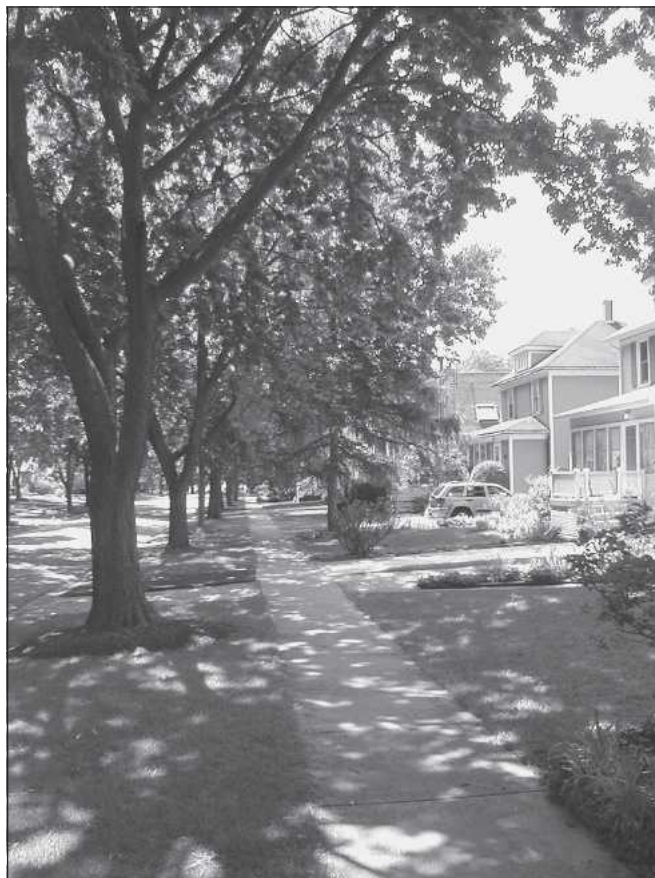
Figure 1. Street trees in Downers Grove, Illinois, U.S.

Despite the modifications to the survey questionnaire, most of the questions on Flannigan's survey were substantially the same as on Schroeder and Ruffolo's. We combined the corresponding survey responses from the three communities to create a single data set, which we used to compare responses from North Somerset and Torbay with those from Downers Grove. (For survey items on which the wordings varied between the surveys, the British wordings are used in the presentation of results subsequently.) It should be noted that because the respondents of these surveys were not randomly sampled from their respective nations, the results of these comparisons do not necessarily correspond to general differences between the populations of the United Kingdom and the United States.