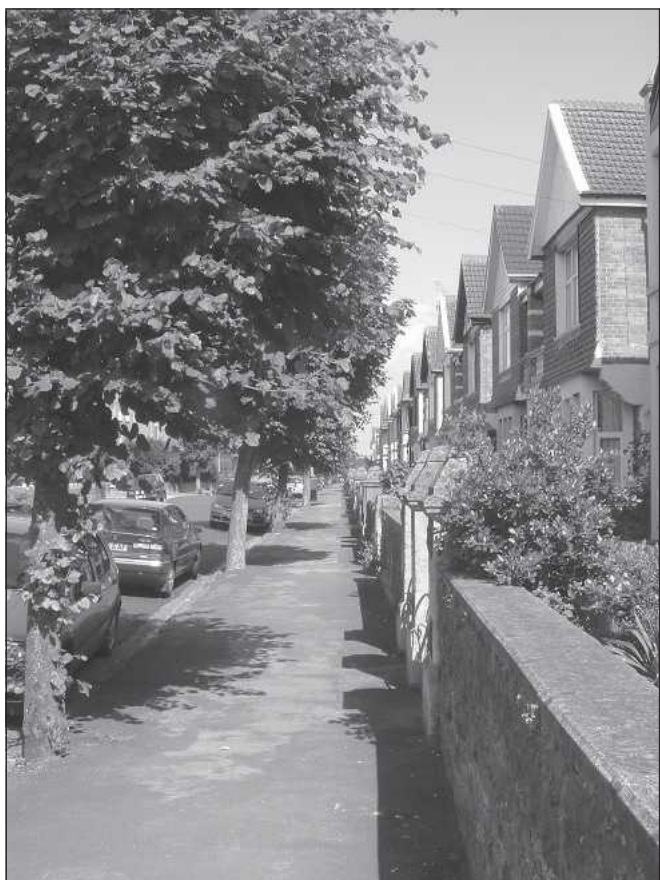
Figure 2. Pollarded street trees in North Somerset, UK.

Although differences between the educational systems in the United States and Britain make a precise comparison difficult, the educational levels of the two groups did appear to be roughly comparable. A high school diploma in the United States, usually obtained at age 17 or 18, corresponds approximately to the GCSE, CSE, and O levels in England, which are attained at age 16. In the Downers Grove survey, 84% of respondents had completed this level and gone on to at least some additional education in college or technical school compared with 70% in the North Somerset/Torbay survey. Graduate school in the United States is equivalent to postgraduate education in the United Kingdom. In the Downers Grove survey, 30% had at least some education at this higher level compared with 26% in the North Somerset/Torbay survey.