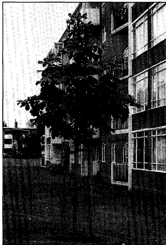
Figure 1. Tree supported with 2 stakes and protected with a wire mesh cage.

to either rule out or encourage the possibilities for tree planting. A decision was made to apply the same available funds as previous years to purchasing 16% of the quantity of the previous year but of larger, higher quality trees. Two hundred containerized advanced nursery stock (ANS) 16- to 18-cm girth (4-in. caliper) trees were selected specific to the identified site but based on nursery stock availability lists and historical success rates. To this end, species included Crataegus monogyna , Sorbus aria , and S. × intermedia , Platanus acerifolia , Fraxinus oxycarpa 'Raywood' and F. excelsior 'Jaspidea', Acer pseudoplatanus 'Leopoldii', and Aesculus hippocastanum 'Baumanii'. It was also decided to protect each tree with a weld-mesh galvanized guard supported by 2 diametrically opposed pressure-treated round wood stakes (Figure 1). To avoid accumulation of litter in the guard, a gap of about 200 mm (8 in.) was left between the bottom of the guard and ground level. Each tree was supported by rubber-sleeved strapping at