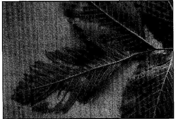
Figure 1. Feeding damage to elm foliage by adult elm leaf beetles. Holes are chewed completely through the leaf tissue, resulting in a "shotgun blast" appearance.

where they mass to spend the winter. While there can be 3 generations per year in southern areas such as California (Dahlsten et al. 1993), only 1 generation occurs in Fredericton, New Brunswick, Canada, where this study was conducted.