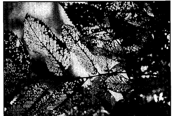
Figure 2. Feeding damage to elm foliage by larval elm leaf beetles. The leaves are skeletonized, leaving the veins and upper epidermis intact.