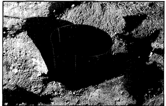
Figure 1. Circling barriers are used to protect hardscape elements from damage by deflecting tree roots vertically to the bottom of the barrier. In this study, four commercially available root barriers were used to examine root development inside and outside barriers.

Aside from not finding a consistent root response to barriers, these reports suggest that rooting depth on the outside of barriers may be related to soil conditions underneath and to the outside of the barrier. In soils favorable for root growth, roots may remain deeper in the profile; in unfavorable soils, roots may tend to develop near the surface. This study was initiated to further evaluate tree root response to circling barriers. Specifically, our objectives were four-fold: 1) to quantify root growth and root distribution of Lombardy poplar ( Populus nigra 'Italica') and Raywood ash ( Fraxinus oxycarpa 'Raywood') trees planted with and without circling barriers, 2) to assess root response to different types of barriers, 3) to evaluate the influence of a subsurface barrier on root distribution, and 4)