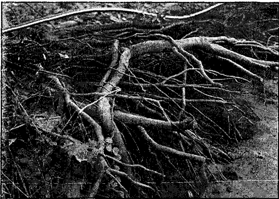
Figure 1. On trees without a root barrier, most roots were within the top 30 cm of soil. The large diameter roots near the soil surface could eventually raise a sidewalk nearby. Note the trunk on the left and the irrigation tubing on the soil surface.